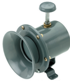
ES Manual Hooter